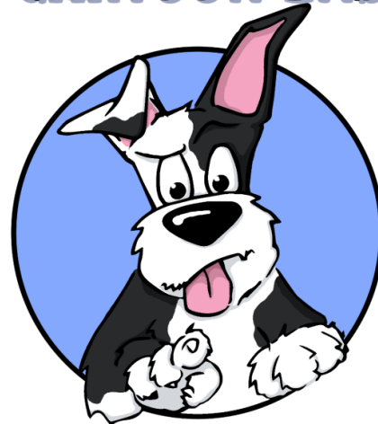
Illustration for magazines, books, logos, merchandise and more, contact: